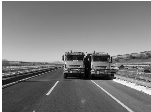
Fig. 2. B&W photograph